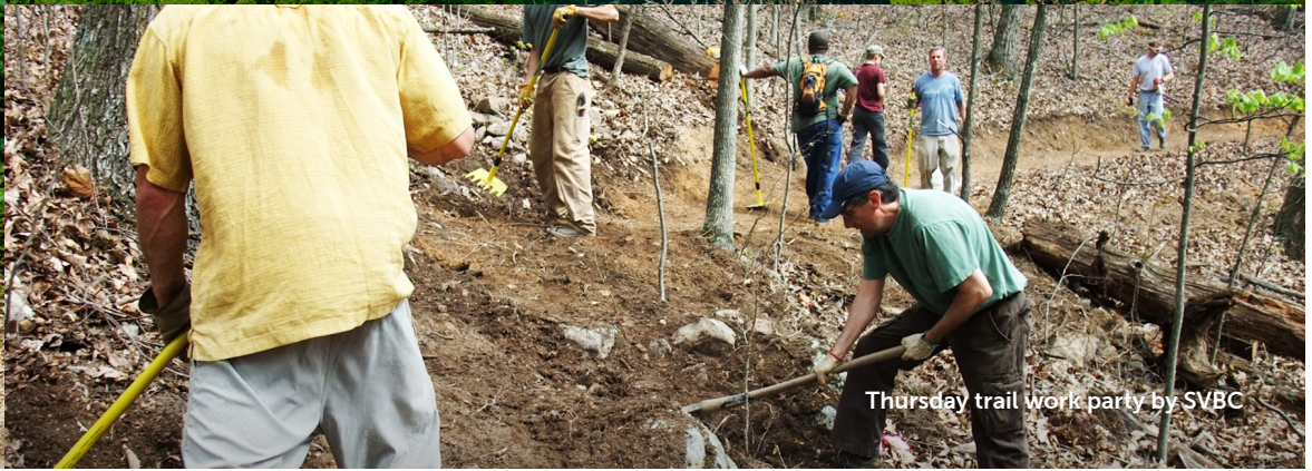
Thursday trail work party by SVBC