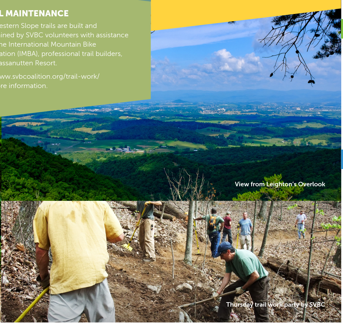
View from Leighton's Overlook