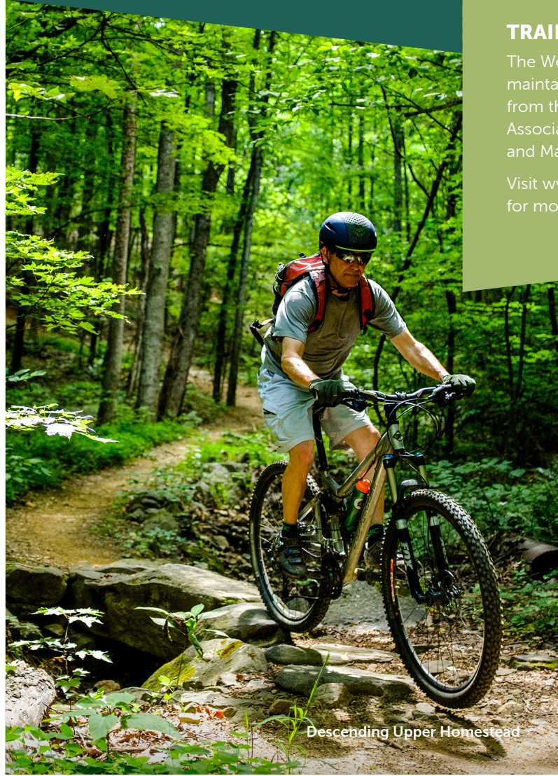
Descending Upper Homestead