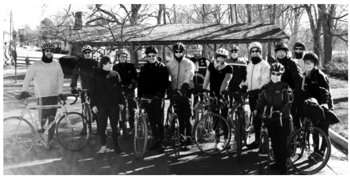
The 2009 SVBC Icicle Ride crew takes a photo op prior to departure on January 1. Wow, remember the many layers of Winter?

With the growing popularity of bicycling, citizens and tourists are looking for safe and convenient roads to bike. Now the web site www.bikethevalley.org offers an online resource assembled by riders of the area to help you choose your route whatever your reason for riding the roads of the beautiful Shenandoah Valley. • The site is a product of the Central Shenandoah Planning District Commission's (CSPDC) Bike Pedestrian Committee, an advocacy ...(continues Page 2)