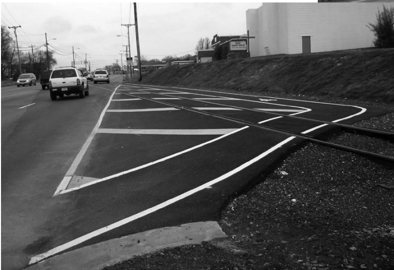
Main Street Railroad Tracks