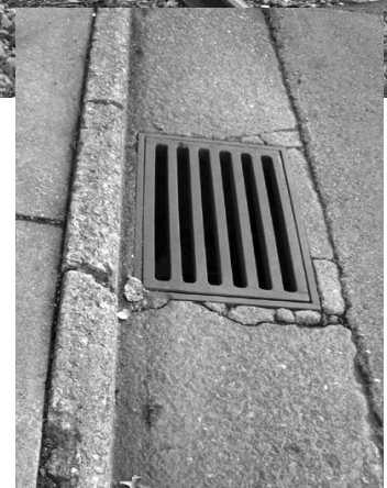
South Main Street / Water Street Drainage Grate