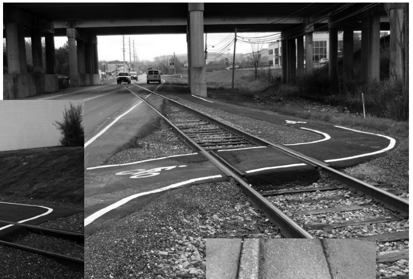
Country Club Railroad Tracks

Mark it on your calendars, June 19 & 20 will be the annual running of the Hoo Ha and SuperD race featuring the SVBC built trails on the Western Slope. This is always a great fundraising event for SVBC.