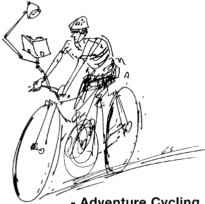
- Adventure Cycling