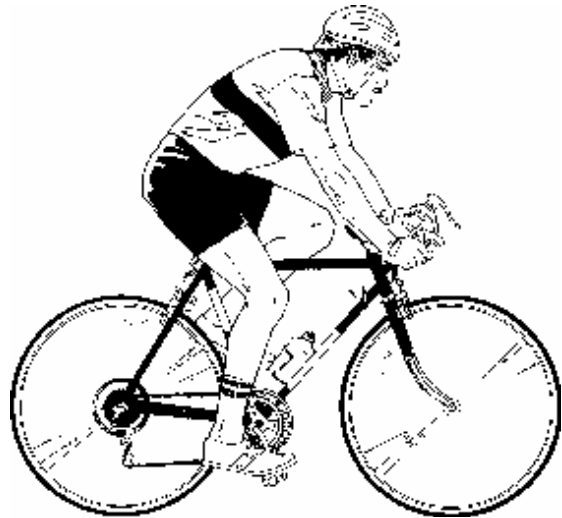
and the new.