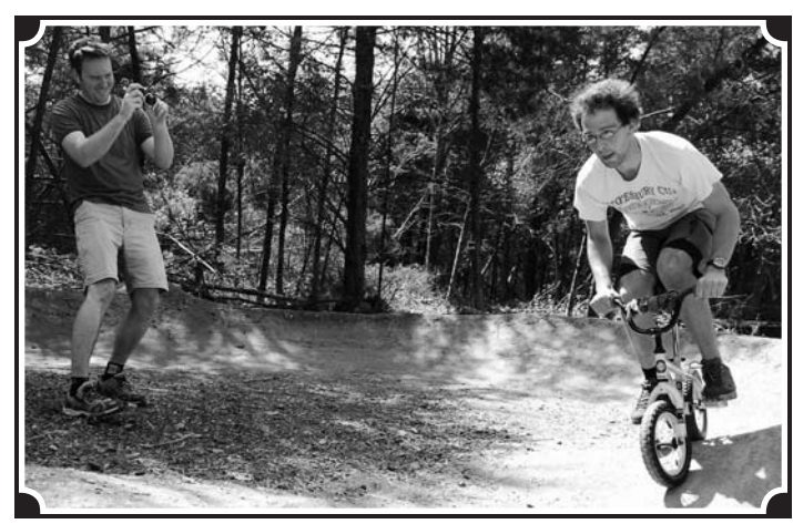
Hillandale official opening photographs courtesy of Joel Schneier.